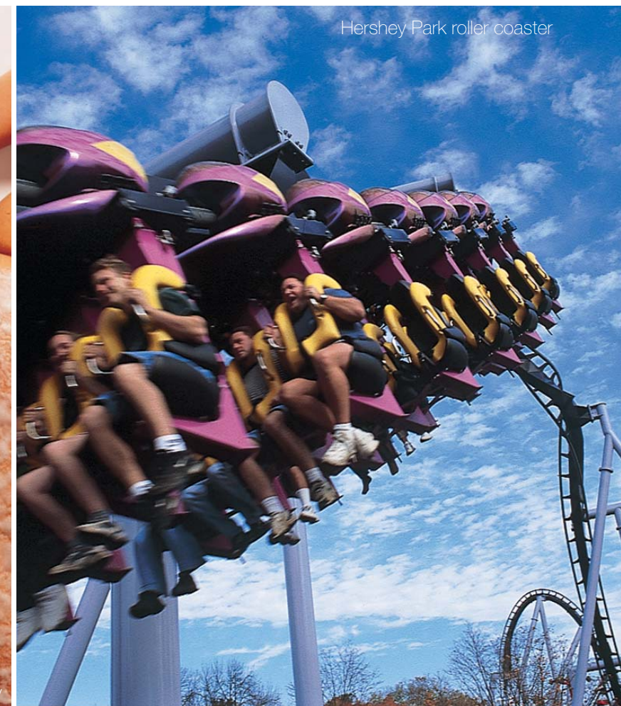
Hershey Park roller coaster

Disneyland may be the happiest place on Earth, but if you need a break from people who are merely smiling and happy, jump on a plane to Harrisburg, Pa., and drive over to Hershey, which touts itself as the “sweetest place” on the planet.