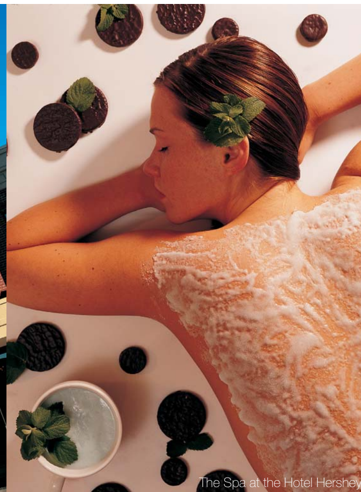
The Spa at the Hotel Hershey